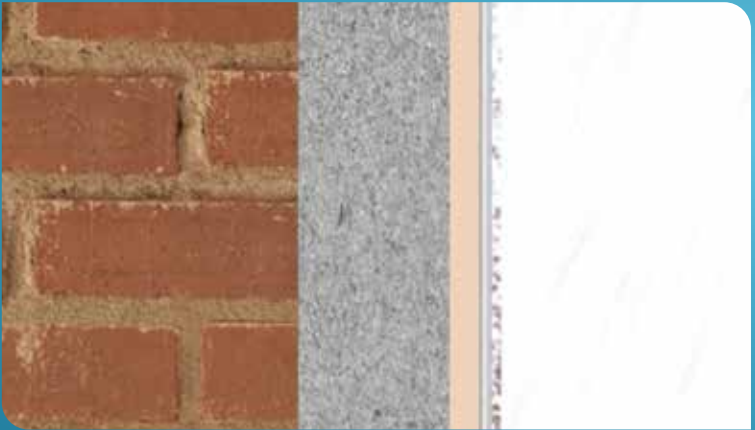
Superior Rainproof Technology allows the rainwater to wash off the dirt and dust easily

Important Note: When wet mud dries on the wall, this could cause stains and discolouration. To prevent this, clean the wall thoroughly with water before the mud dries.