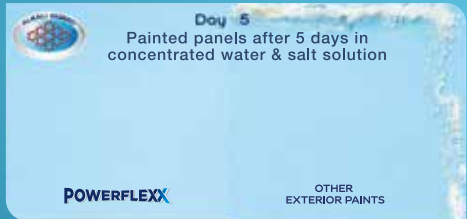
Paint molecules are strongly bonded together, to give superior protection from alkali