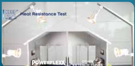
Special pigments reflect infrared radiation back to the atmosphere to keep homes cooler